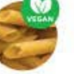
Penne gluten free