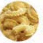
Creste di Gallo