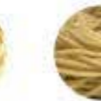
Spaghetti alla chitarra